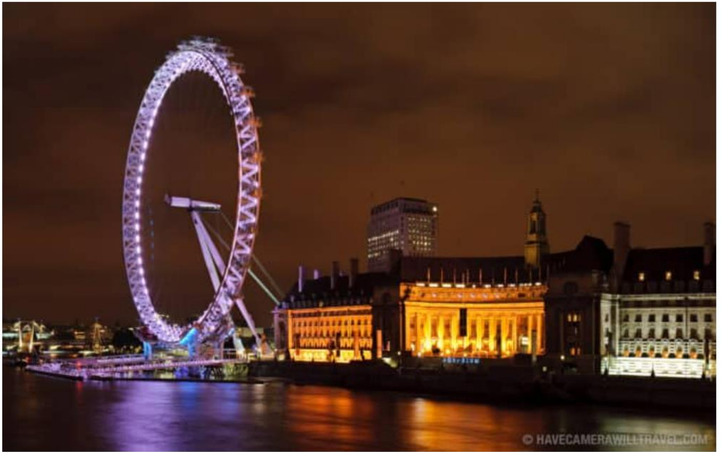
View from Westminster Bridge.