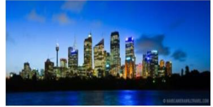
Sydney Harbour at Night