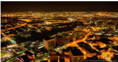
Newark at Night from the Air