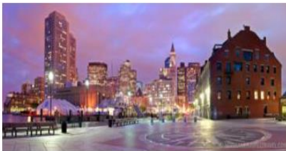
Boston's City Skyline at Night