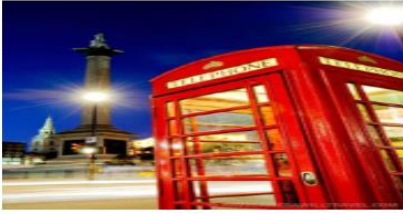
London by Night