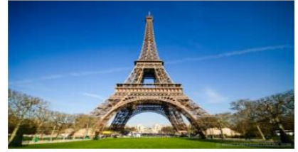
The Iron Lady of Paris (The Eiffel Tower)