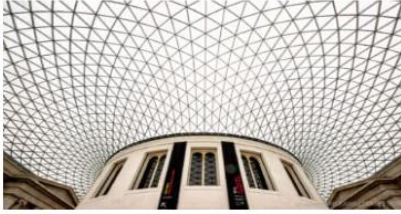
The British Museum