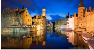
Bruges by Night