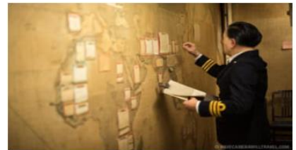
The Churchill War Rooms